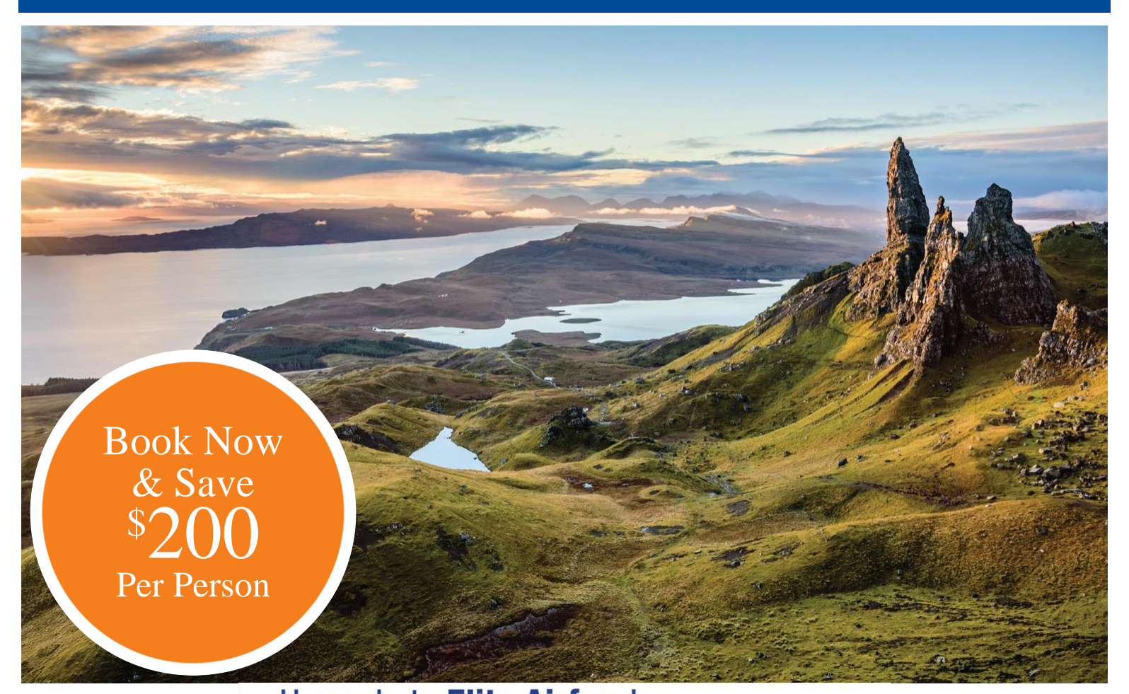
Upgrade to Elite Airfare! see inside for details