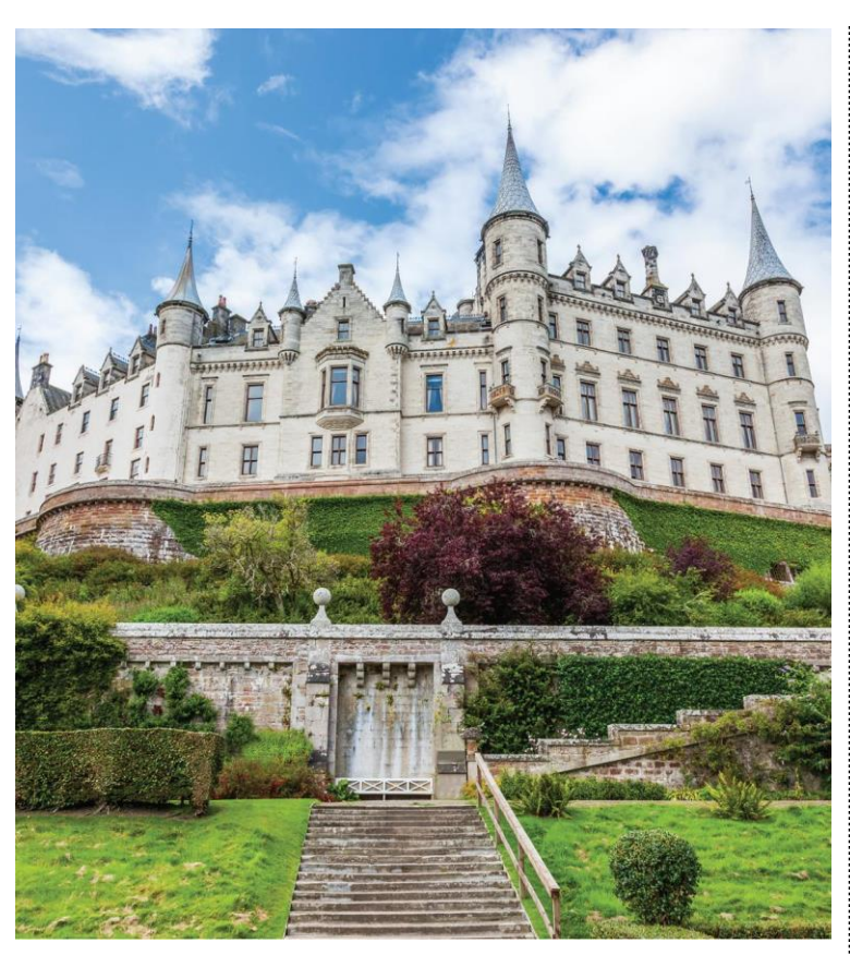
10 Days • 14 Meals: 8 Breakfasts, 6 Dinners

HIGHLIGHTS... Bagpipe Lesson, Isle of Skye, Loch Ness, Orkney Islands, Dunrobin Castle, Sheepdog Demonstration, Choice on Tour: McCaig's Tower or Dunollie Castle Museum, Edinburgh Castle, Scottish Cooking Experience, Royal Edinburgh Military Tattoo